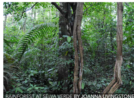
RAINFOREST AT SELVA VERDE